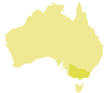
Data from the National Landcare Directory; 12/04/2016