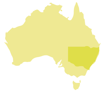
Data from the National Landcare Directory; 12/04/2016