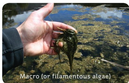
Macro (or filamentous algae)

Generally one application is enough, however if the algae infestation is severe retreat after 10-14 days as necessary.