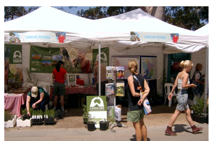
The Landcare tent at the Sustainable Living Festival at Federation Square.

I helped to man the Landcare tent at the Sustainable Living Festival last weekend which was a fantastic event. Those visiting the tent were mainly Melbourne locals wanting to know how to get involved but there were also several people who owned properties outside Melbourne who wanted to work with local Landcare groups to restore the health of their property and to meet new people.