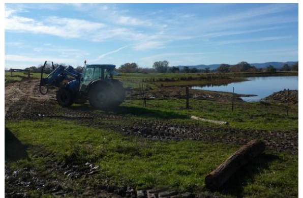
Transforming a farm dam into a wetland at Vin Murray's property. These works form part of the Strathbogie Ranges CMN Farm Wetlands for Woodlands Project, of which Gecko CLaN is a project partner.

The group then went on a tour of some high quality sites and were lucky enough to catch a glimpse of two Brolgas flying above cemetery road.